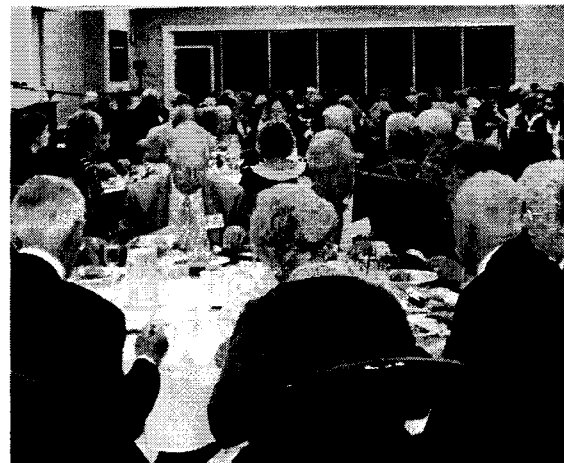
Part of the audience